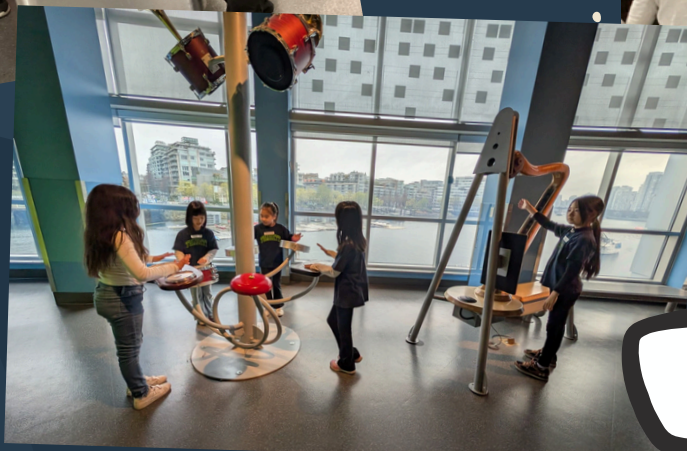
Exploring Sound, Force & Motion