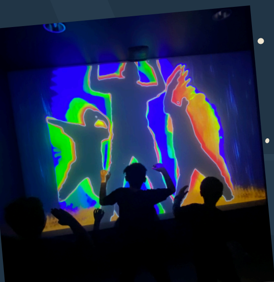
Learning about Optical Illusion