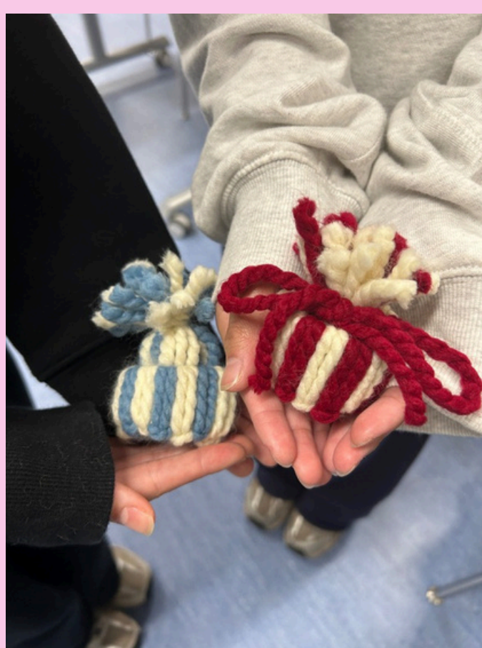
Toque Ornaments in the Library