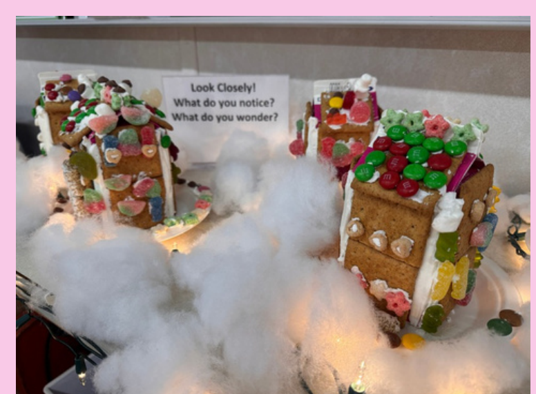
Gingerbread Houses in Div. 15