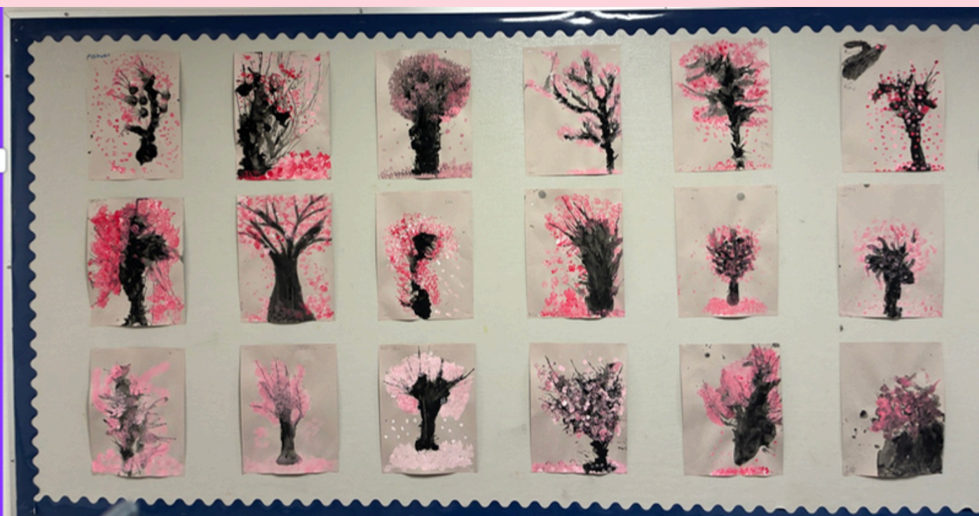
Cherry Blossoms by Div. 11