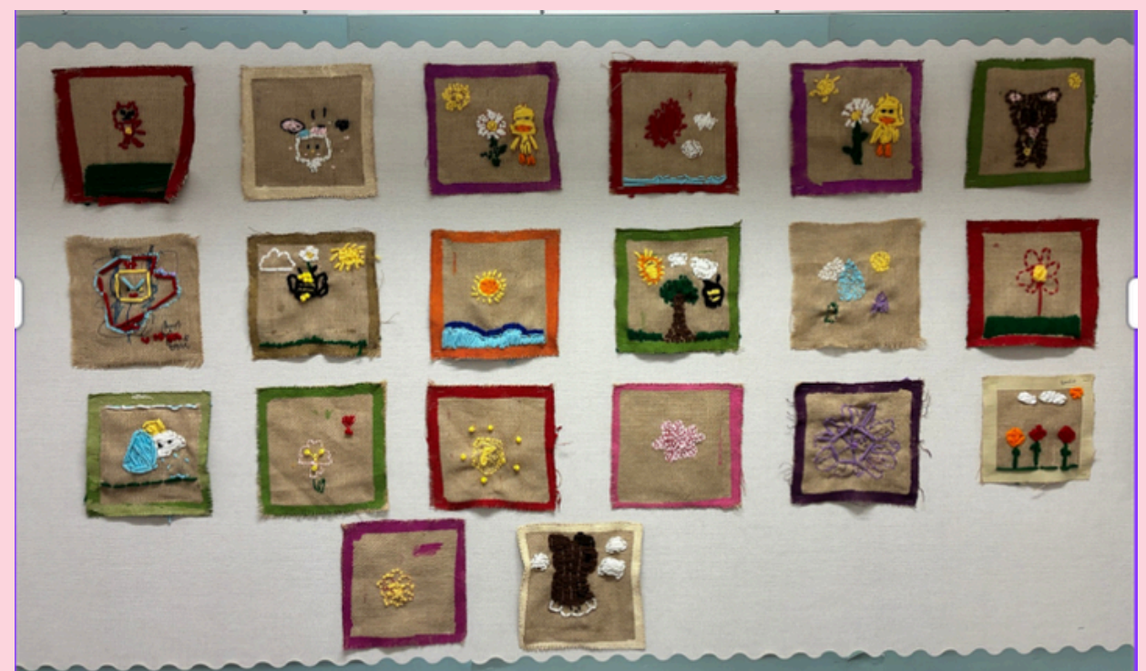
Many classes have been exploring sewing.