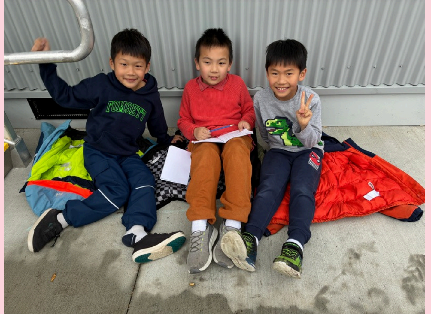
Recess time hangs.