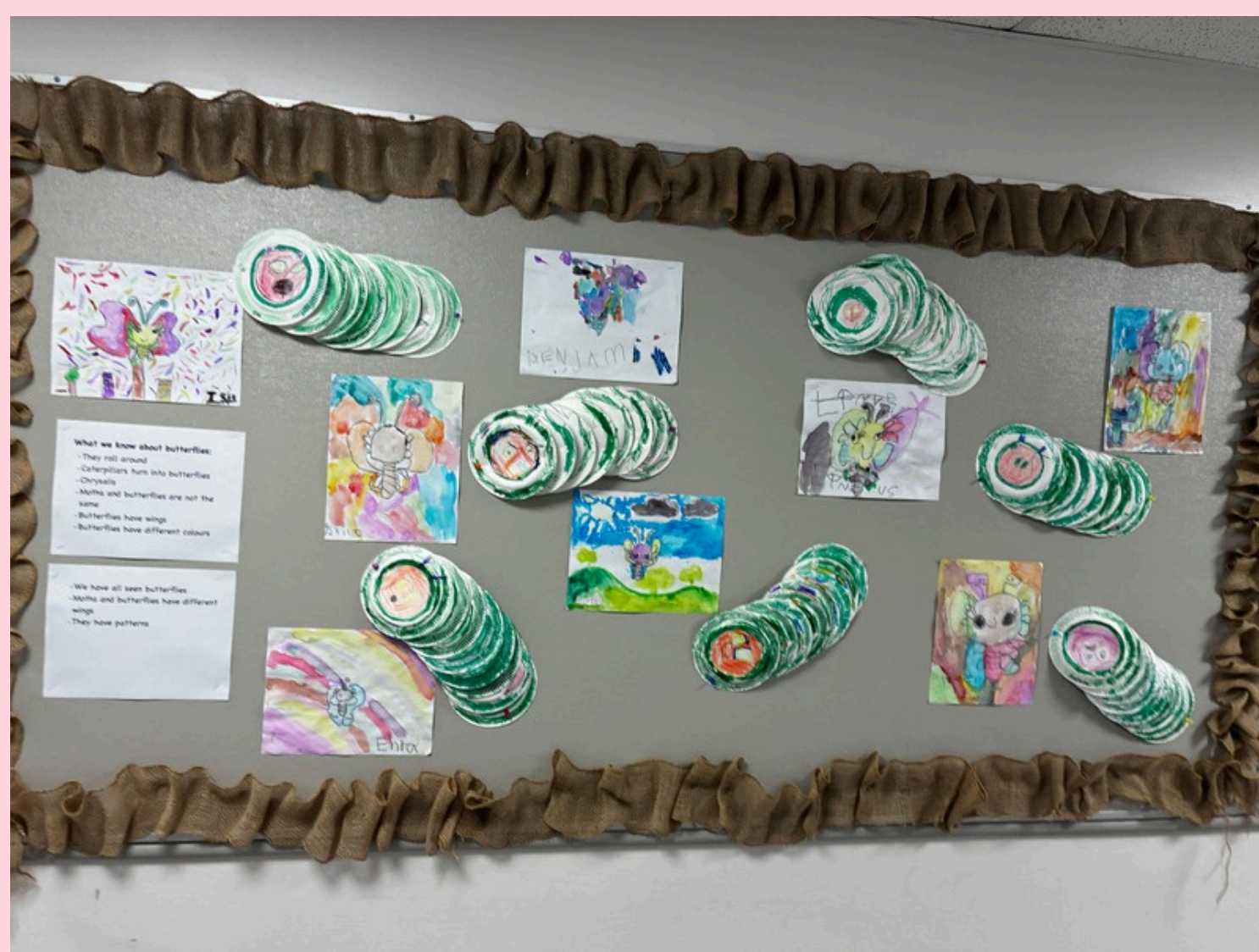
Division 19, 20, and 21 continue their butterfly inquiry and have recorded their wonders!