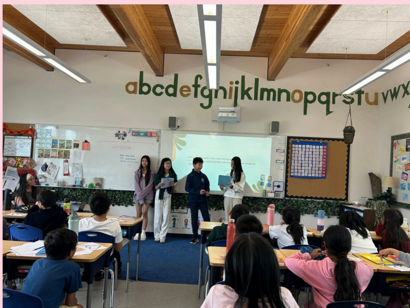
Division 3 Leadership students have begun collecting data on a topic they believe needs our attention at Tomsett. This data will help them to create their action plan and will be able to measure if their intentional actions make a difference to reducing or eliminating the issue they have identified.