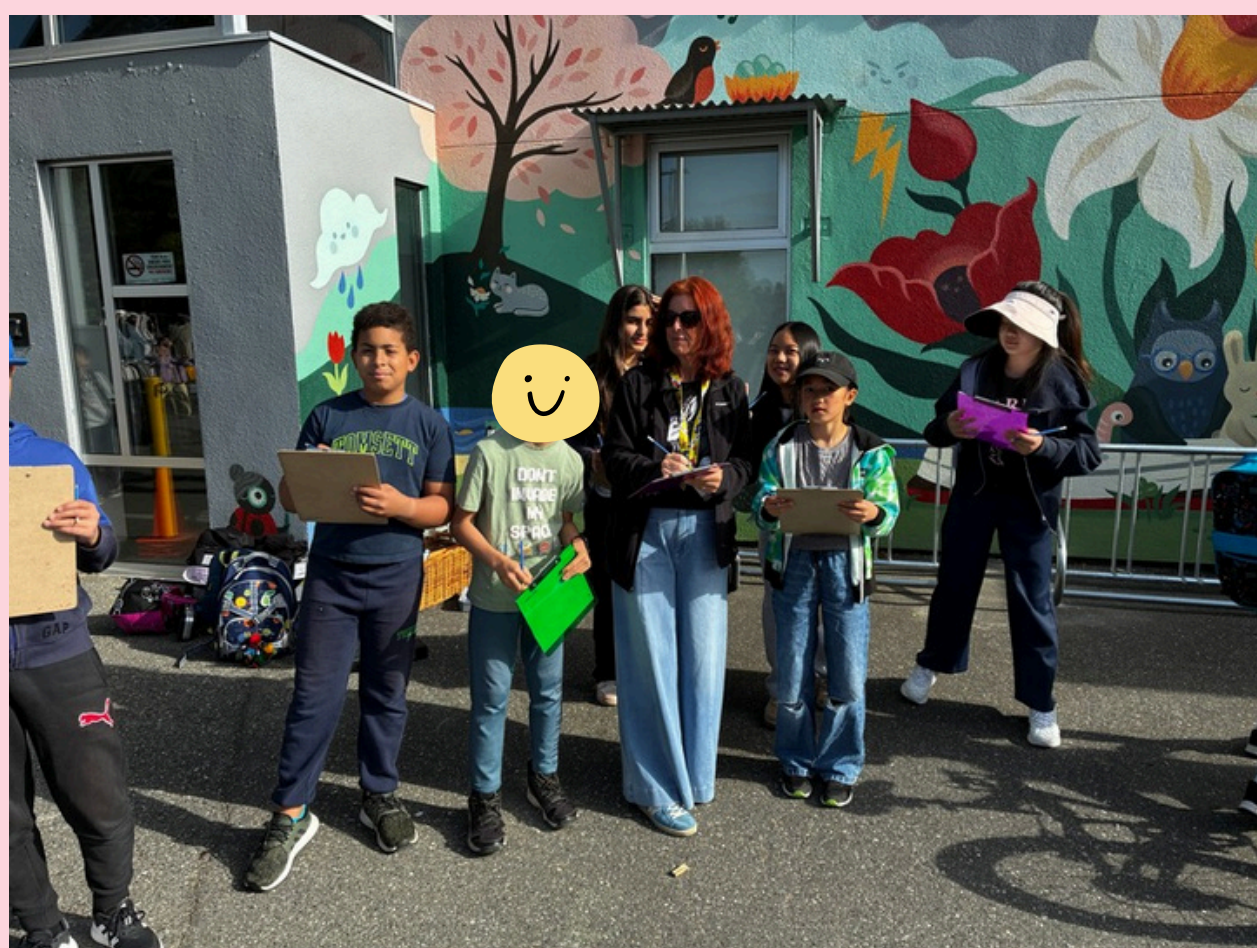
Division 5 students taking data on how students get to school each day!