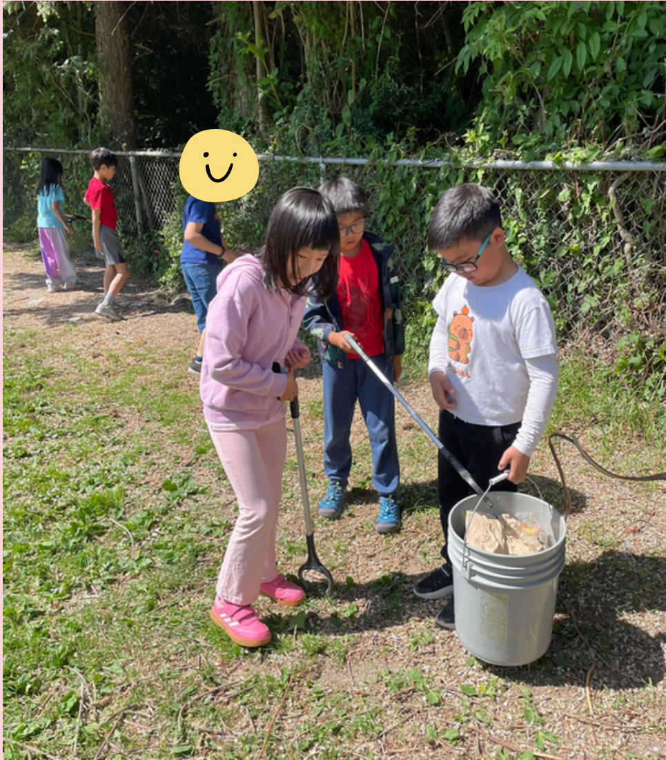
Division 12 being good stewards of our place with their grounds clean-up!