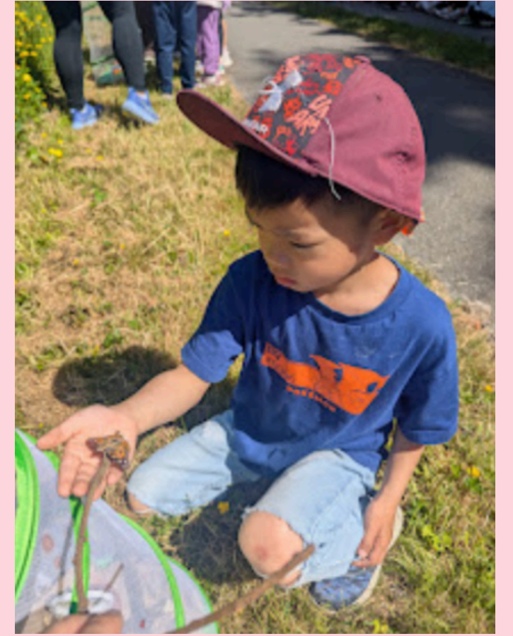
Division 19 releasing their butterflies!