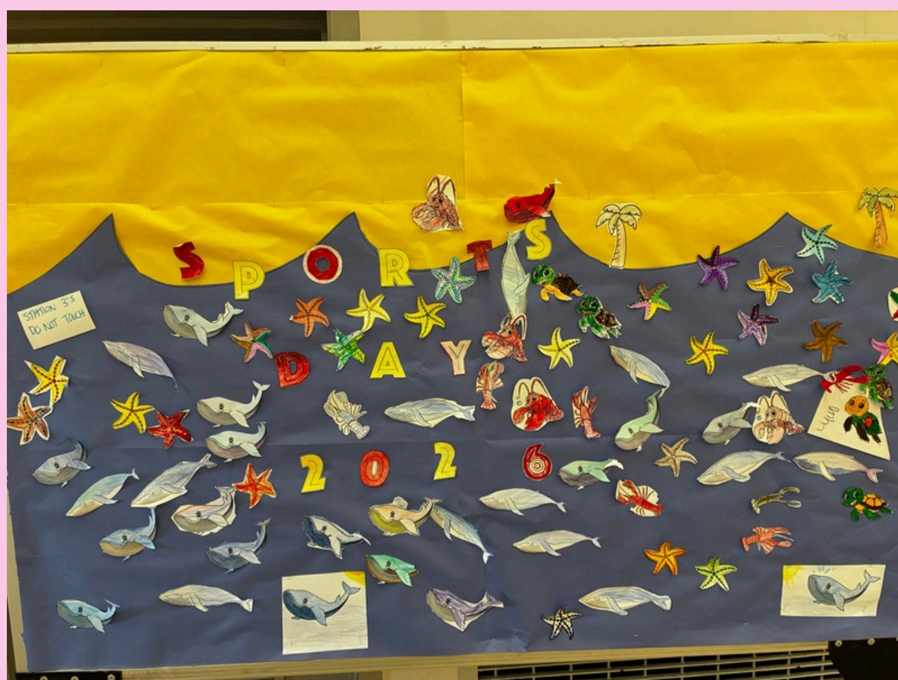
Sports Day 2026 Under the Sea!