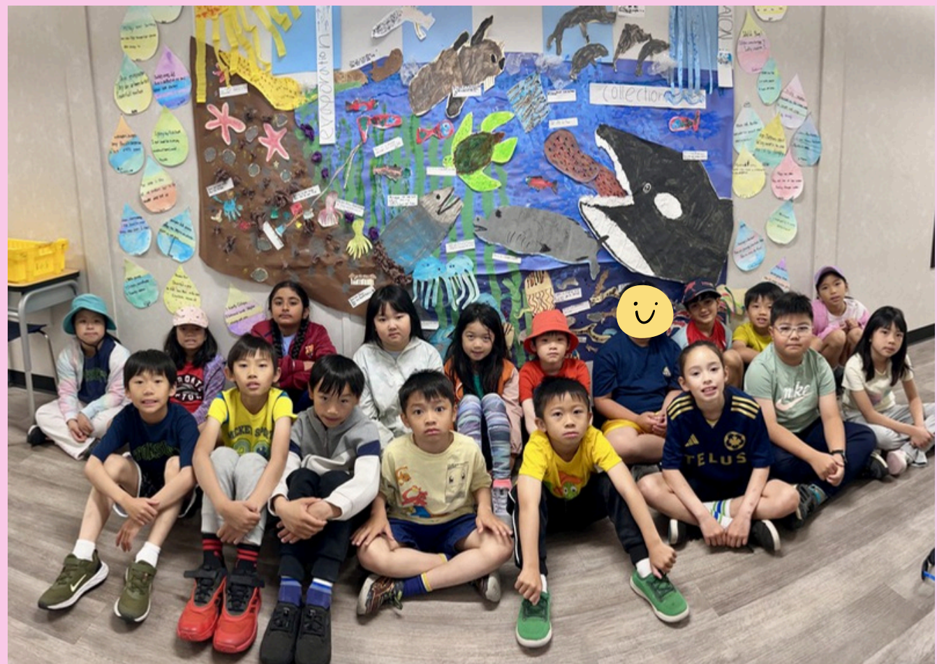
Ocean Mural and Haikus by Division 10!