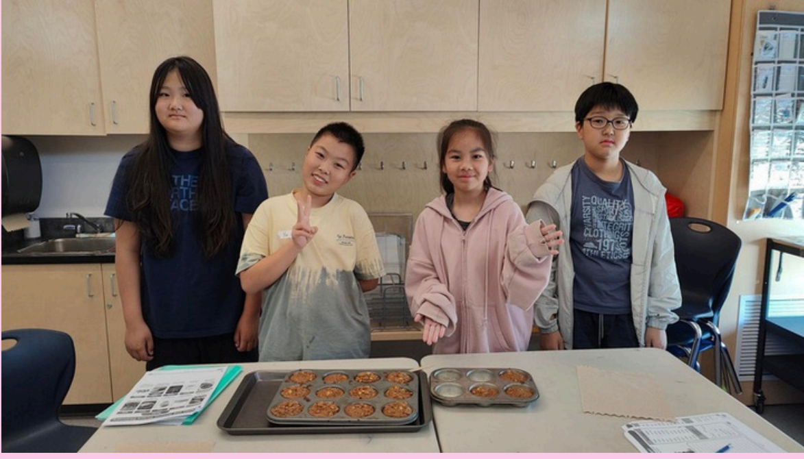
Students making apple muffins after learning about procedural writing!