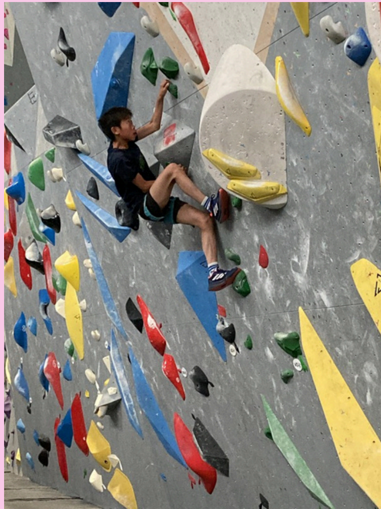
Grade 7s Year End Oval Field Trip