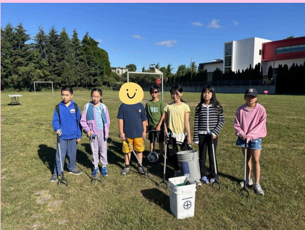
Morning helpers cleaning up garbage on the school grounds to get ready for Sports Day