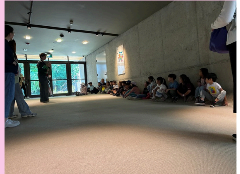
Div. 17 and 18 went to the Museum of Anthropology this week!